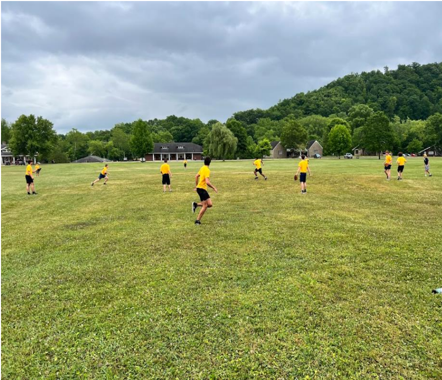
Pictured above is a softball match held Tuesday between Monroe-Webster and Lewis-Upshur counties.