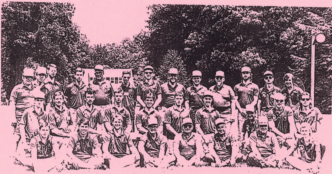
JR. AND SR. COUNSELORS - THE CORE OF THE BOYS' STATE PROGRAM