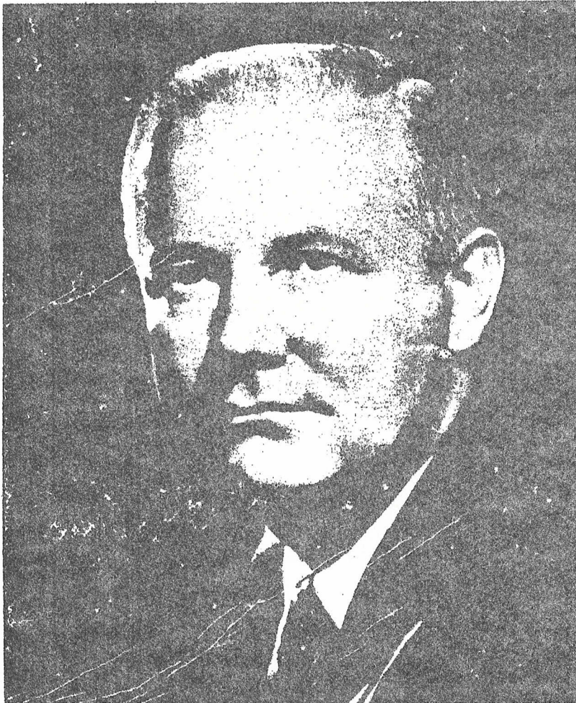
ARCH A. MOORE, JR.