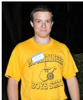
Congratulations Governor Elect Damian Cooke!!