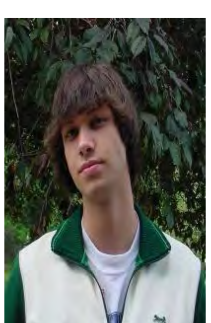
What is your favorite meal? Lunch because they don't have to mess with the flag which means it's not as long.